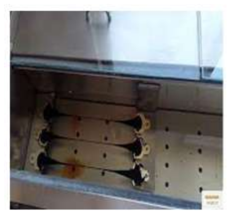
Figure 4 Ductility test of Bitumen

The ductility of bituminous material is the distance in centimeters to which it will elongate before breaking when a briquette specimen of the materials is pulled at a specified speed and at specified temperature. The ductility values of bitumen generally vary from 5 to 100cm for different bitumen grade.