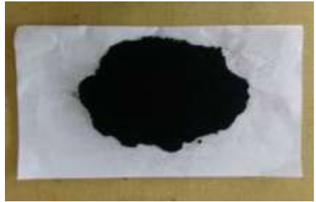
Figure 2 Natural Rubber

A tough elastic polymeric substance made from the latex of a tropical plant or synthetically. Natural rubber, also called India rubber or caoutchouc, is an elastomer (an elastic hydrocarbon polymer) that was originally derived from latex, a milky colloid produced by some plants.