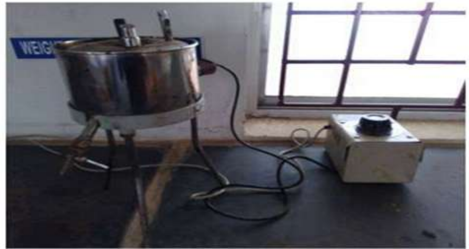
Figure 5 Viscosity test for Bitumen