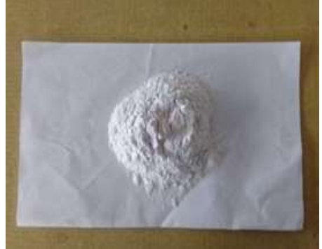
Figure 3 Recycled Glass Powder

Glass powder is finely ground glass. These fine glass particles remind you of talcum powder. Use extreme care when handling this dry powder pigment to prevent breathing the dust particles.