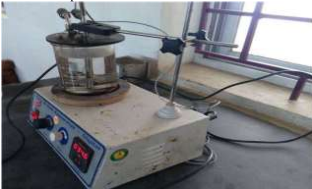
Figure 6 Softening test for Bitumen

which the substance attains a particular. Degree of softening under specified conditions of test. The softening point of bitumen ranges 30^{\circ} C to 80^{\circ} C. Here we taken the bitumen softening point value is 41.35^{\circ} C