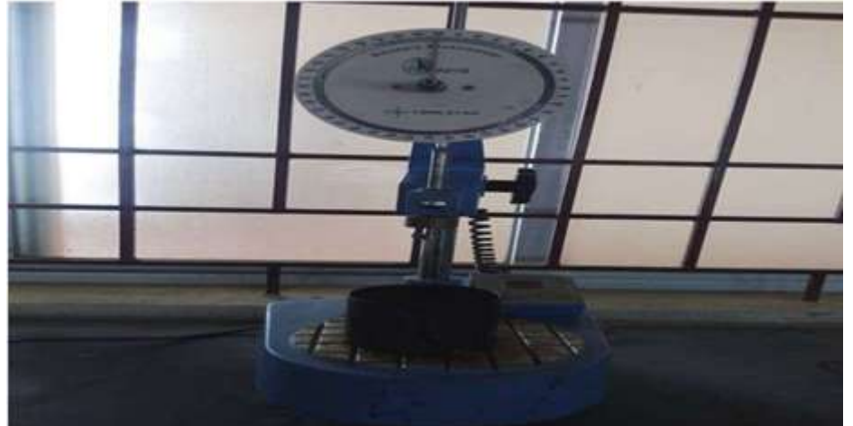
Figure 7 Penetration test for Bitumen

tension exhibited by these materials. Table 4 shows the penetration test results of conventional and modified bitumen.